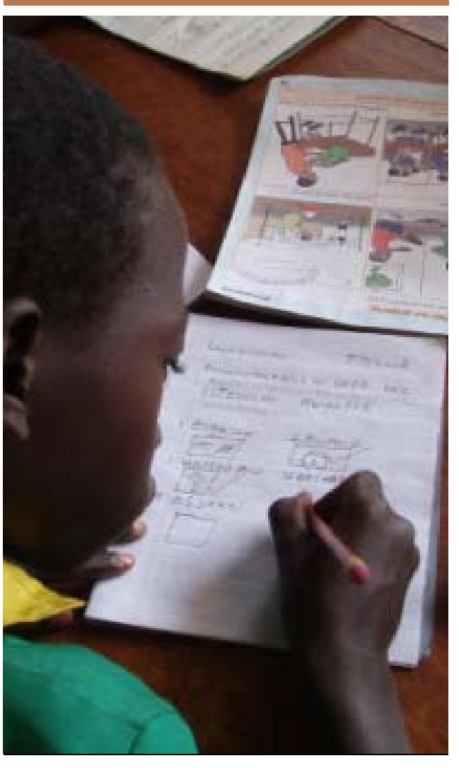
Busanga Primary School, Zambia.

In Zambia, Ireland was instrumental in piloting a successful literacy programme for primary school children involving the use of local languages. The programme developed materials in seven of the main local languages to teach initial literacy and numeracy skills. Research is showing that children learn more quickly and the knowledge gained is retained, when programme has been scaled up into the National Primary Reading Programme which is now a strong part of the curriculum.