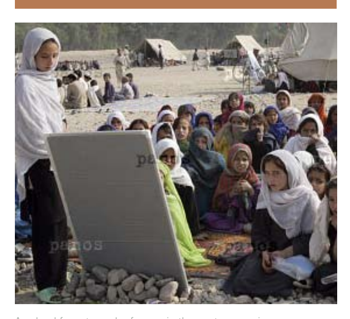
A school for returned refugees in the eastern province of Nangahar, Afghanistan.

In Afghanistan, funding was provided by Irish Aid to Unicef for post emergency schools construction/ school feeding programmes.