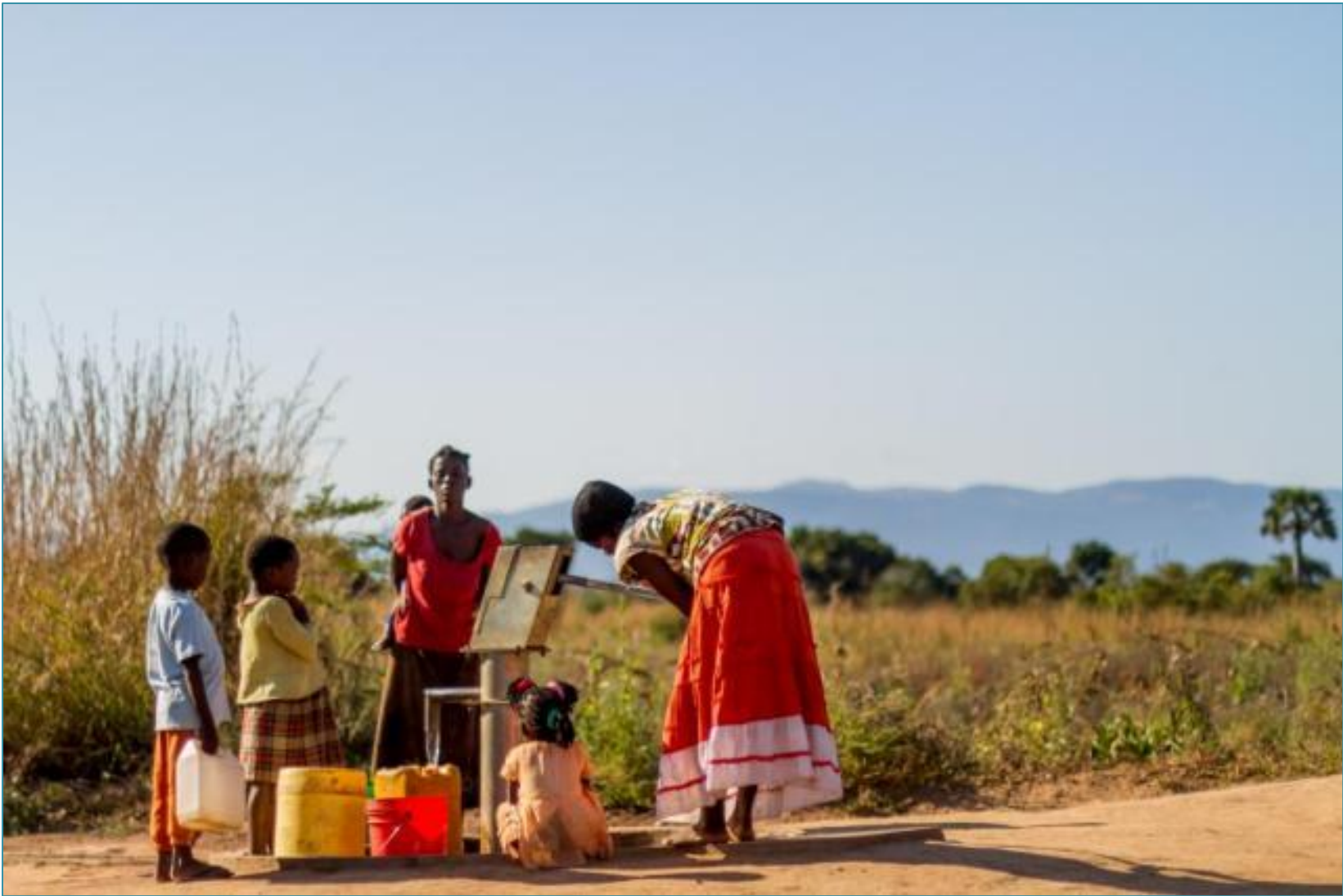
Villagers from Muleka Chiefdom draw water from Irish Aid funded Borehole Irish Aid, 2013